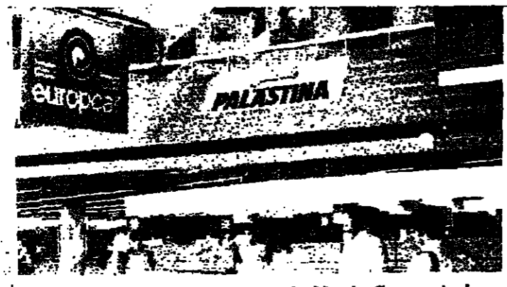
Notable feature of an exhibition organised by the German-Arab Friendship Society at Frankfurt airport was the presence of a stand for Palestine, which caused great anger among Zionist circles in West Germany.